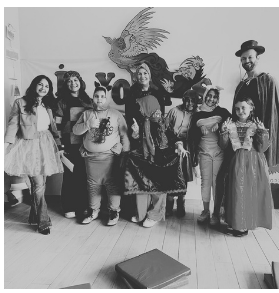
Teachers helped our 5th graders bring the story of The Farmer and the Fox to life by acting out the fable in both Turkish and English.