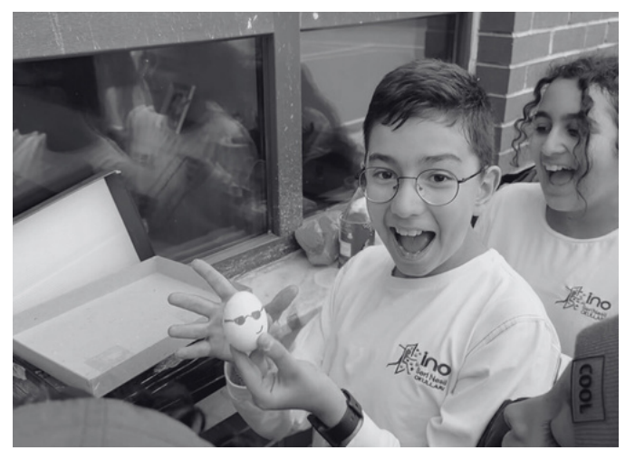
Fifth and sixth grade students took part in the Save Eggward Egg Drop to test their egg-protection containers designed from recycled materials.