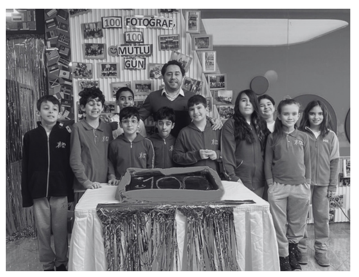
Fourth grade students celebrate the 100th day of school with cake.